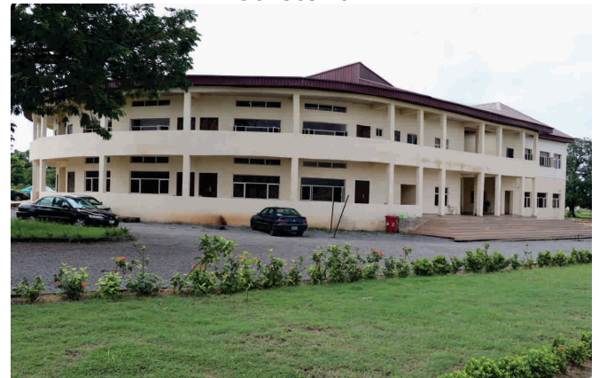
Faculty of Environmental Sciences