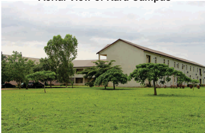
College of Medicine and Allied Health Sciences Karu Campus