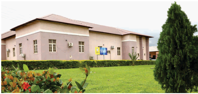
Faculty of Science and Technology