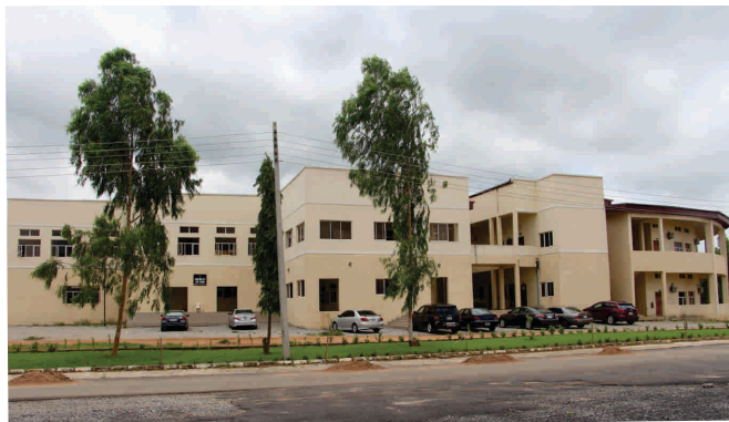
Faculty of Law