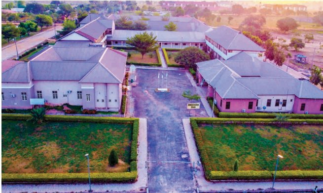
Aerial View of Karu Campus