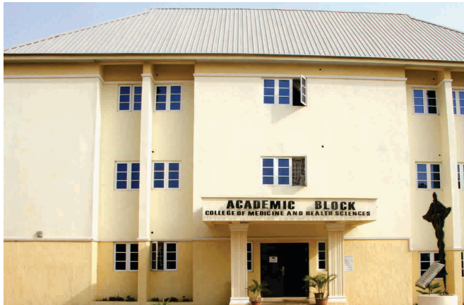
College of Medicine and Allied Health Sciences (Academic Building) Jos Campus